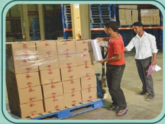
Pallets are shrink wrapped before put away