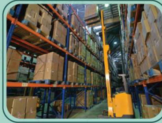
Stackers for putaway and picking