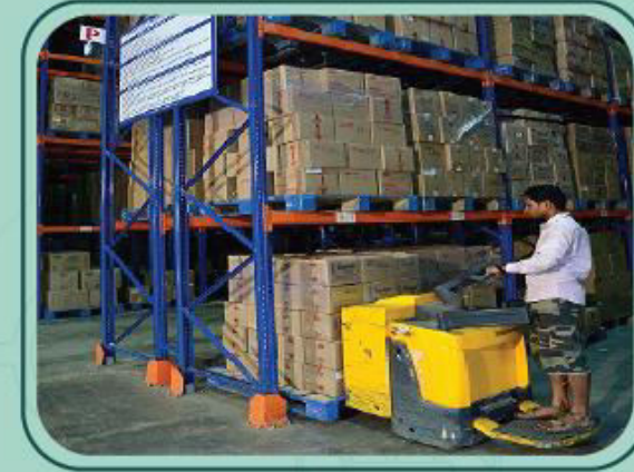
BOPTs move stocks from dock to racks

❧ Strategically located at Bhiwandi, servicing Mumbai sub-urban areas